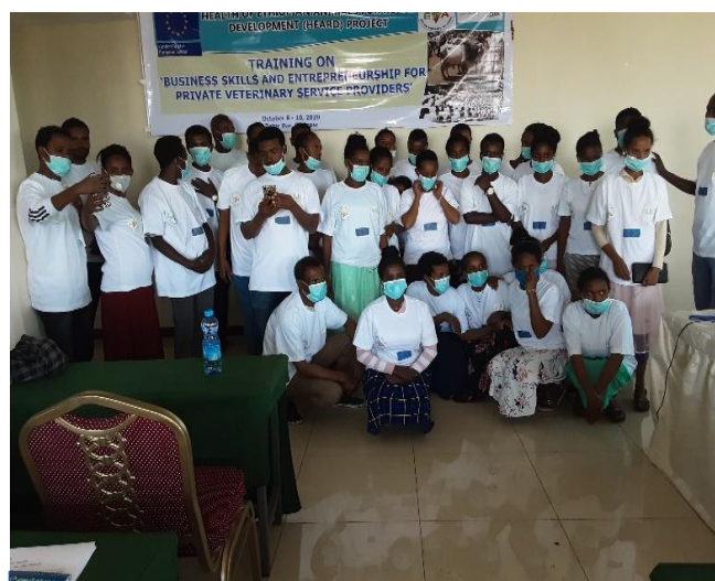
Business skill and entrepreneur training for Private Veterinary service providers, Bahir Dar

Most veterinary professionals and para-professionals do not have access to a regular and standard way of gaining knowledge and skills to keep updated and provide the quality service required. This activity aims to address the deficiency by establishing a CPD system in Ethiopia, which provides the required needs.