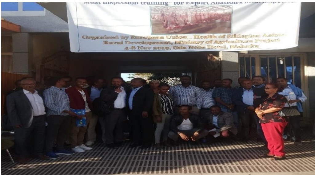
Figure 4: Training of Meat Inspectors: Addis Ababa University