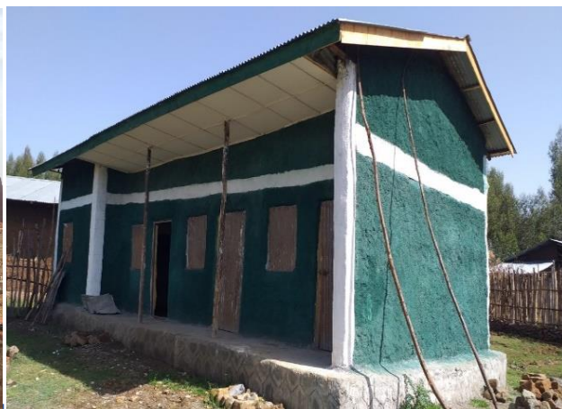
Newly Maintained clinic at Amhara region, Meket wereda