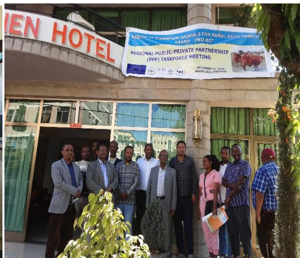
Regional PPP taskforce Meeting