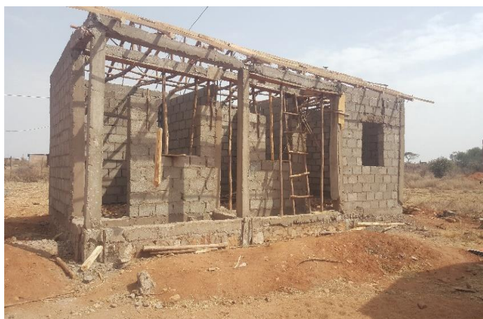
New type C Clinic under construction at Oromia region, Dubuluk Wereda