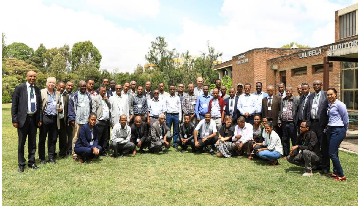
Figure 2: Participants at the Inception Workshop

The first and the second HEARD Steering committee (SC) meetings held in July and November 2020 respectively. The SC functioned as per the ToR developed (in the first meeting) mainly for the oversight of the HEARD implementation including optimising the governance of the project including ensuring compliance with the applicable policies, strategies and standards. The SC is chaired by the State Minister for Livestock Resources (of the MoA), and members are: the MoA - CVO; animal health sector directorates ; EUD; NAO/MoF; ILRI/EVA; the three HEARD regional livestock bureau, and; the Federal Agricultural Transformation Agency.